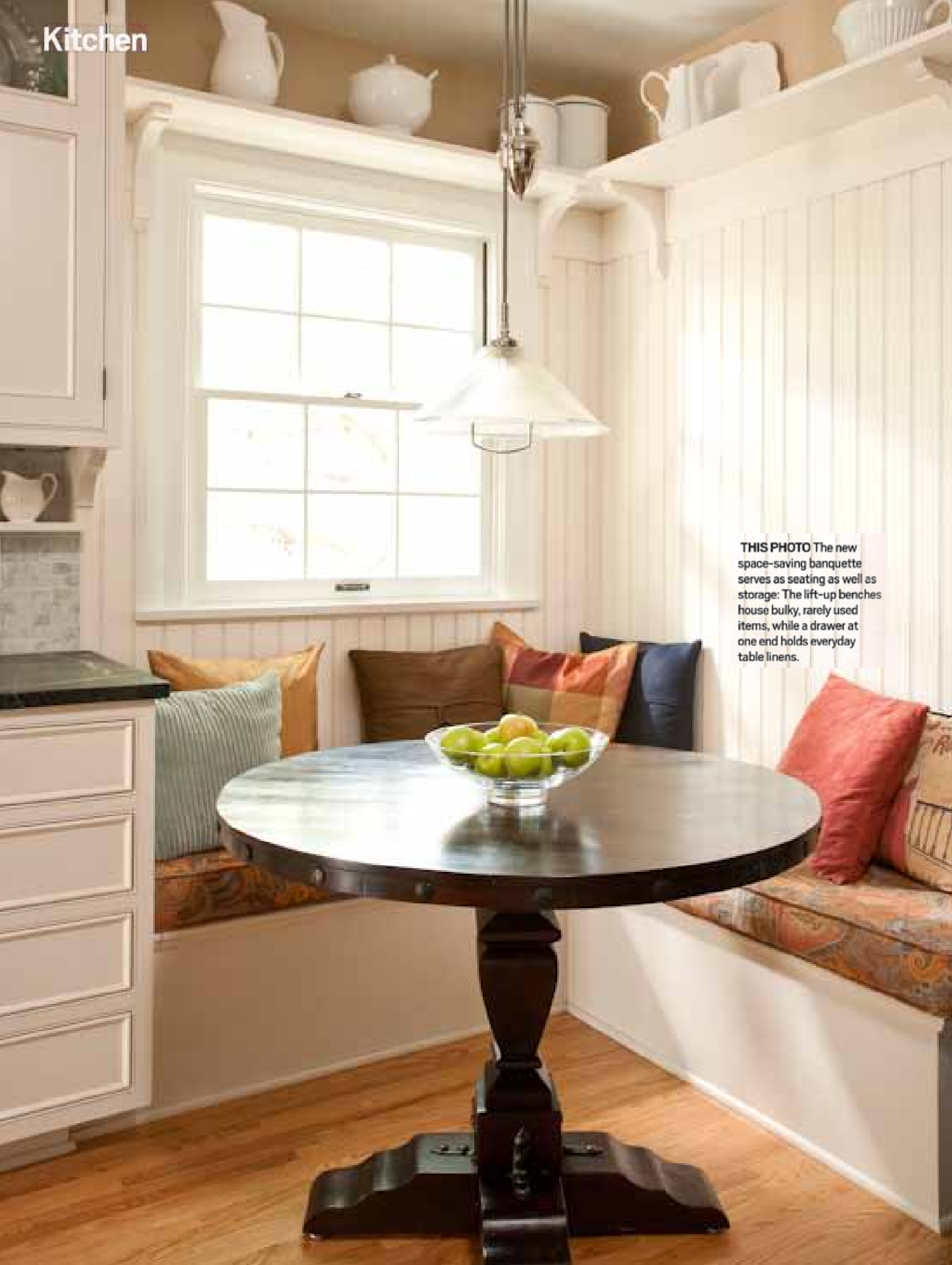
THIS PHOTO The new space-saving banquette serves as seating as well as storage: The lift-up benches house bulky, rarely used items, while a drawer at one end holds everyday table linens.